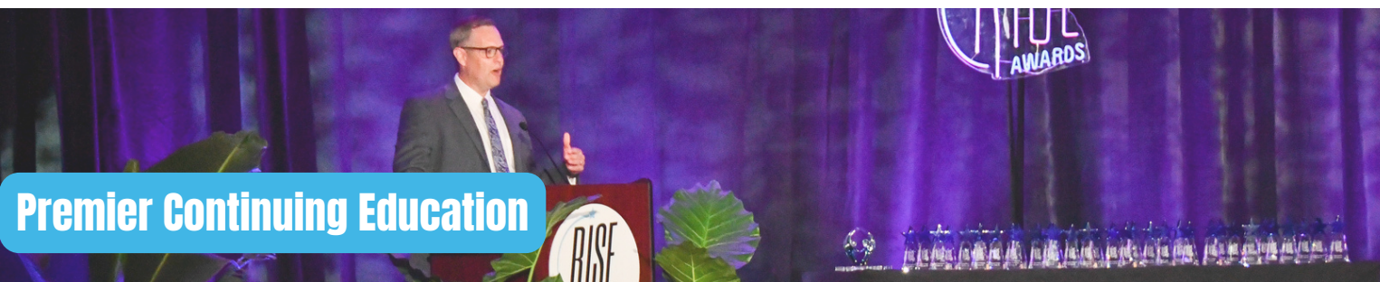
Premier Continuing Education