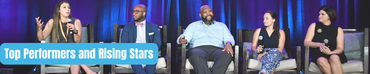
Top Performers and Rising Stars