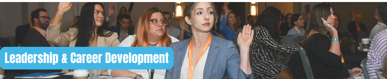
Leadership & Career Development