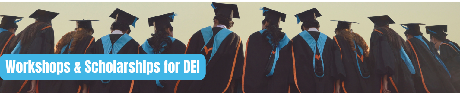
Workshops & Scholarships for DEI