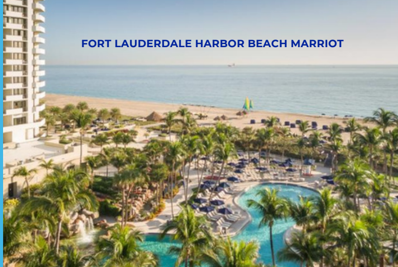
FORT LAUDERDALE HARBOR BEACH MARRIOT

Join us for the 2nd Annual Leadership Summit and the 7th Annual RISE Awards in Fort Lauderdale, FL on May 23-24th at the Marriott Harbor Beach Resort & Spa. We are excited to bring you a fast-paced, exciting day of interactive leadership training, networking, and a proper celebration for the best talent in the insurance industry. This year's 35 winners under 35 will be honored along with Mentor of the Year and the all new LEAD (Leadership in Equity & Diversity) Award recipient. In attendance are past RISE Award honorees, graduates of the mentorship program, committee leaders, advisory board, top performers in the insurance industry from across the country and more. We encourage all rising insurance star executives and those who wish to support and celebrate with us to attend. We look forward to partnering with you!